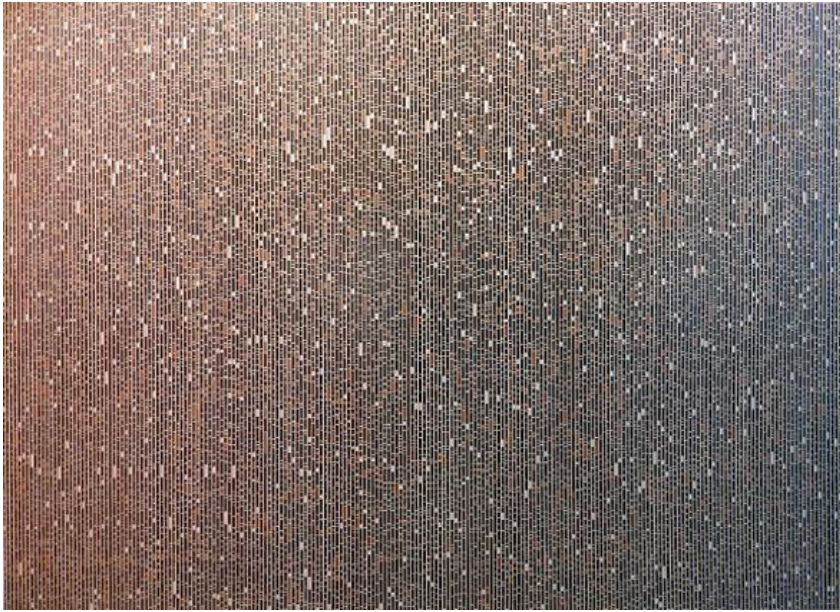
Yuvan Bothisathuvar Dilema, 2014 Paper on plywood 60" x 83" (152 x 211 cms) Rs. 3,50,000/-