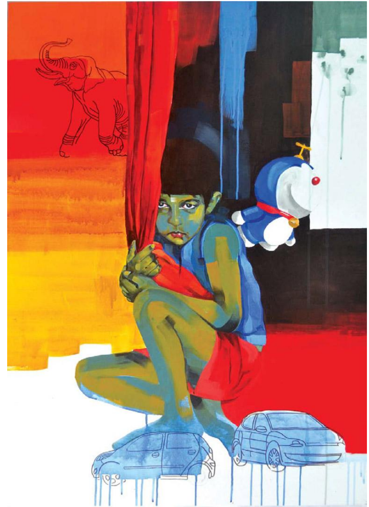
Ritu Sinha Make me one with everything- I Acrylic on canvas 46" X 33" (117 x 84 cms) Rs. 85,000/-