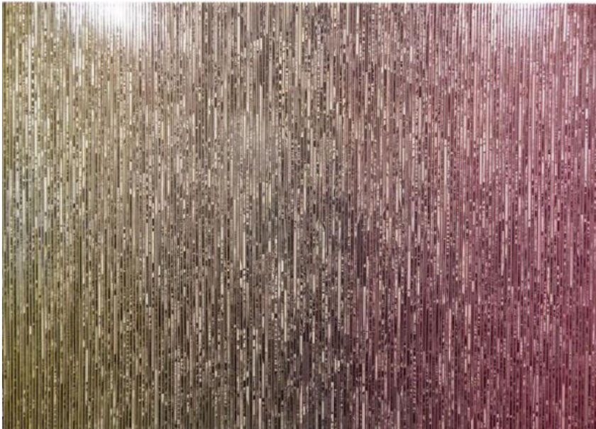
Yuvan Bothisathuvar Dilema,-II 2015 Paper on plywood 60" x 83" (152 x 211 cms) Rs. 3,50,000/-