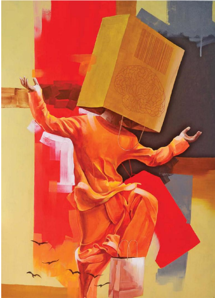
Ritu Sinha All That Glitters Acrylic on canvas 46" X 33" (117 x 84 cms) Rs. 85,000/-