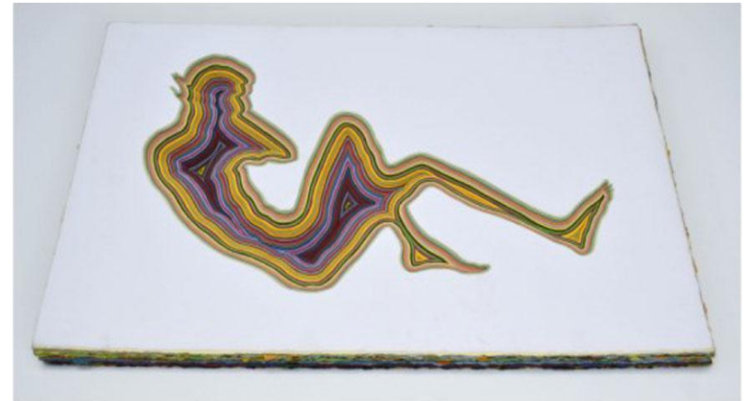
Janarthanan Rudhramoorthy Nest 01, 2015 Paper (37 layers) 19" x 11.5" x 1" (48 x 29 x 3 cms) Rs. 1,00,000/-