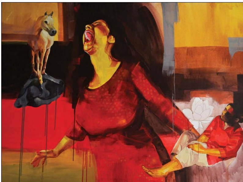
Ritu Sinha No one wants to scream Acrylic on canvas 46" X 62" (117 x 157 cms) Rs. 1,25,000/-