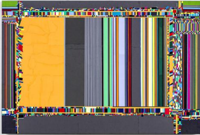
Yuvan Bothisathuvar Scotland Landscape-II, 2014 Poster on plywood 30" x 36" (76 x 91 cms) Rs. 90,000/-