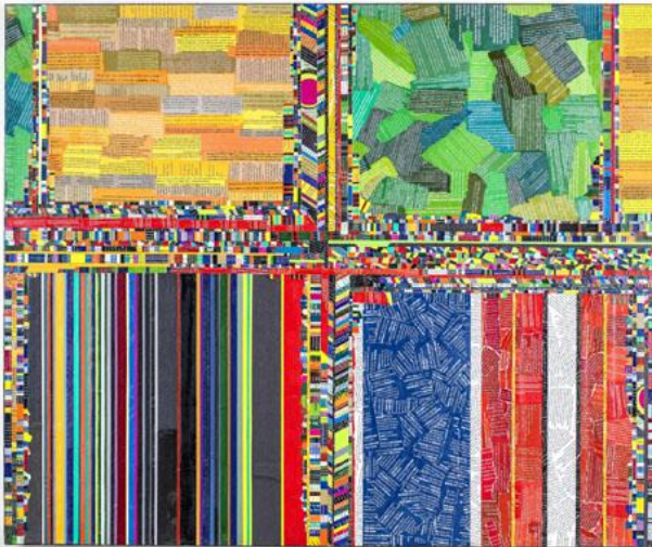
Yuvan Bothisathuvar Scotland Landscape-II, 2014 Poster on plywood 30" x 36" (76 x 91 cms) Rs. 90,000/-