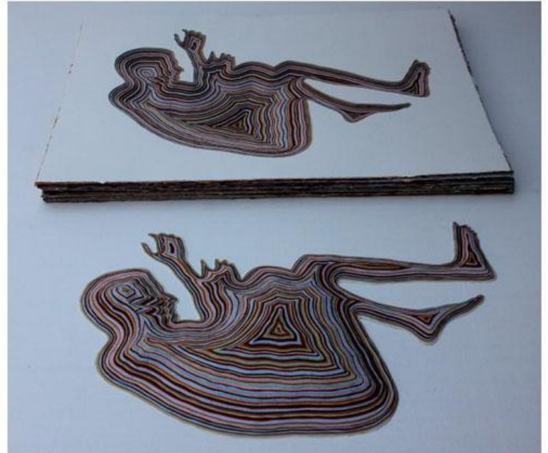
Janarthanan Rudhramoorthy Nest 05, 2015 Collage on paper 24" x 19" x 1" (61 x 48 x 3 cms) Rs. 1,25,000/-