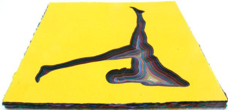
Janarthanan Rudhramoorthy Nest 03, 2014 Canson paper 19" x 15.5" x 1" (48 x 40 x 3 cms) Rs.1,00,000/-