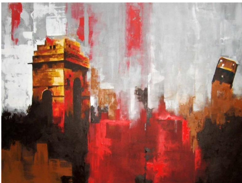
Ritu Sinha Is Delhi Safe Acrylic on canvas 46" X 62" (117 x 157 cms) Rs. 1,25,000/-